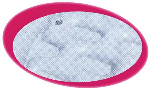
Inflatable floor of the Aquarium Birth Pool

The Aquarium Birth Pool consists of a three ring design with soft see through walls, sturdy sidewalls allow even adults to sit on the edge and an inflatable floor providing extra cushioning.